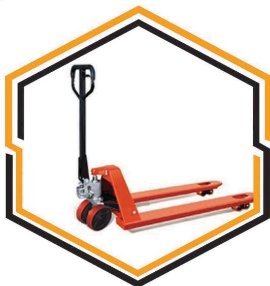
Hyd. Beam Lifting Pallet Truck