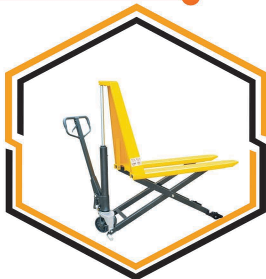
High Lift Pallet Truck