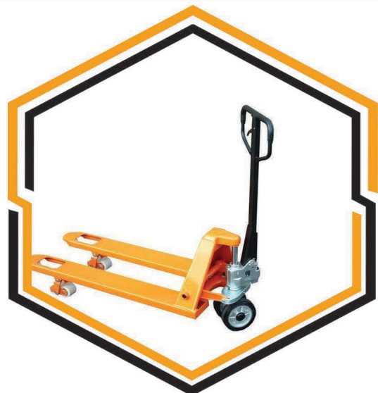
Hydraulic Hand Pallet