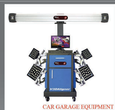
CAR GARAGE EQUIPMENT