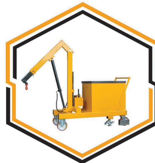
Dead Weight Floor Crane