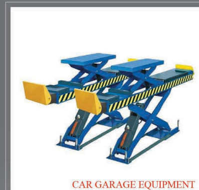
CAR GARAGE EQUIPMENT