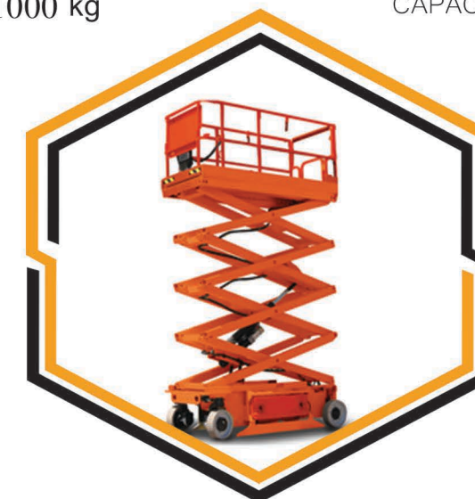
Heavy Duty Hyd. Scissor Lift - Table (Fixed Pit Mounted)