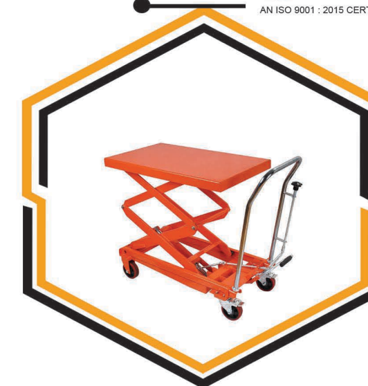
Manual Scissor Lifting Table