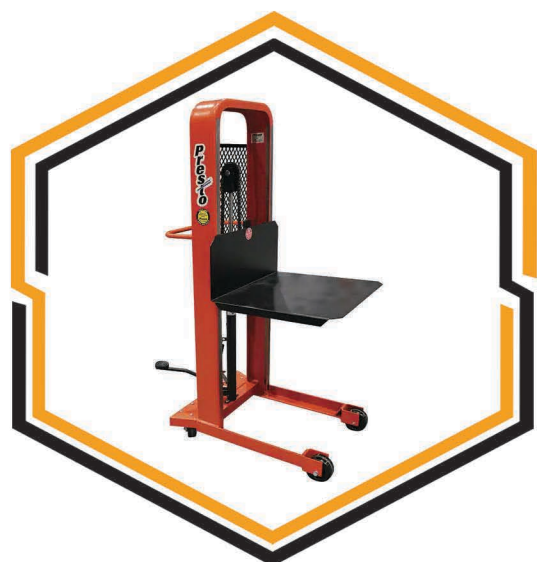
A. C. Power Pack Stacker with Detachable Platform