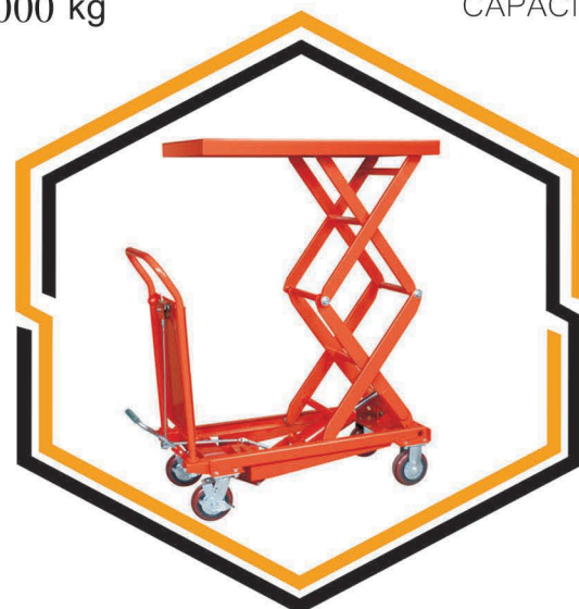
Manual scissor Table