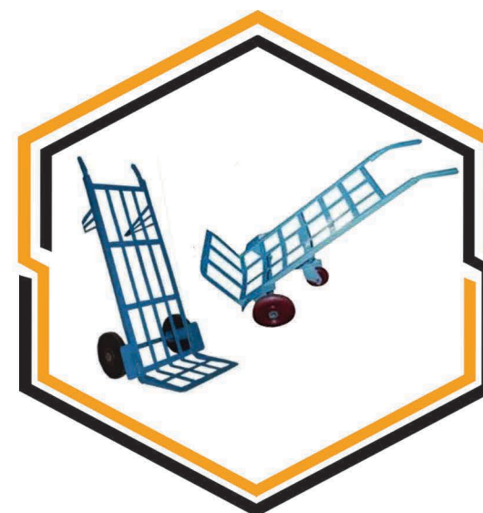
Bales Trolley (Luggage Trolley)