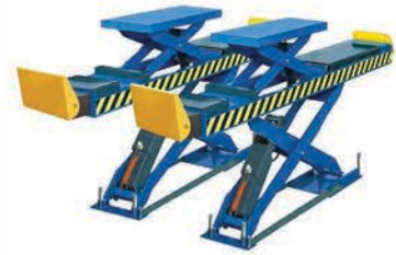
CAR GARAGE EQUIPMENT