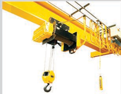
MATERIAL HANDLING EQUIPMENT