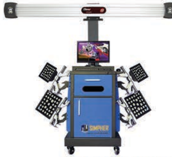
CAR GARAGE EQUIPMENT